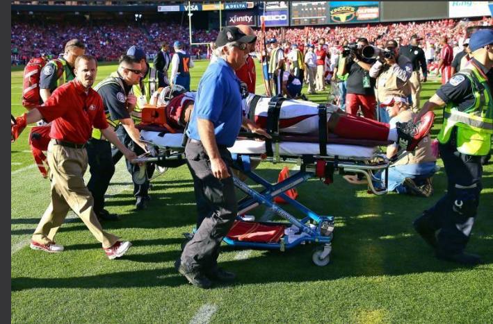
The Medical Team. An NFL player is carted off the field after being injured.

Challenges that accompany being a radiologic technologist in the NFL include: examining much larger patients, shooting through pads and football attire, pay, and injuries being televised.